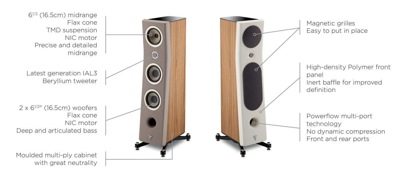
Kanta N°2, Walnut cabinet, Matt Warm Taupe and Ivory front panels

Kanta N°2 is a three-way floor standing loudspeaker totally dedicated to performance. Kanta N°2 is equipped with a new generation IAL tweeter featuring a Beryllium inverted dome and Flax sandwich cone speaker drivers. This is an unprecedented combination of technologies to guarantee precise, detailed and warm sound. Focal's latest acoustic innovations have been integrated into these floorstanders encompassing a modern and distinctive design. These loudspeakers are perfect for rooms measuring up to 320ft<sup>2</sup> (30m<sup>2</sup>) and they're also ideal for larger rooms of up to 750ft<sup>2</sup> (60m<sup>2</sup>).